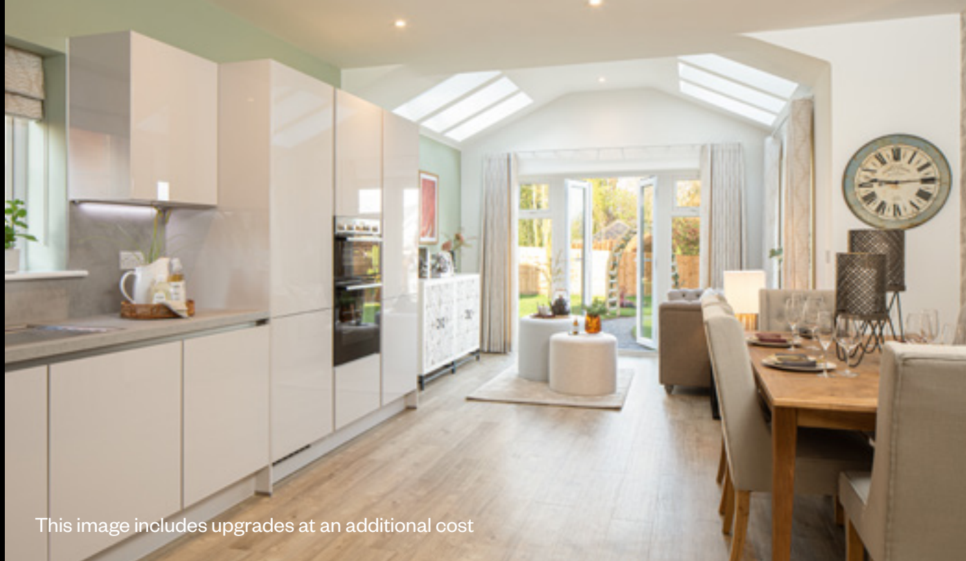
This image includes upgrades at an additional cost