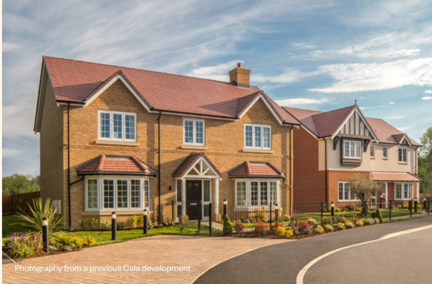
Photography from a previous Cala development