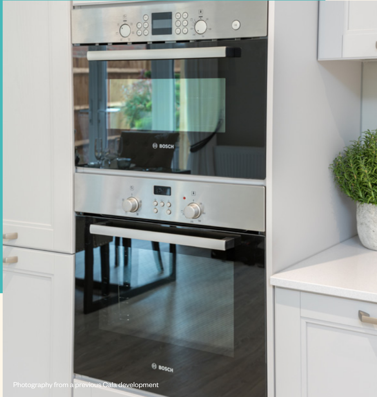
Photography from a previous Cala development