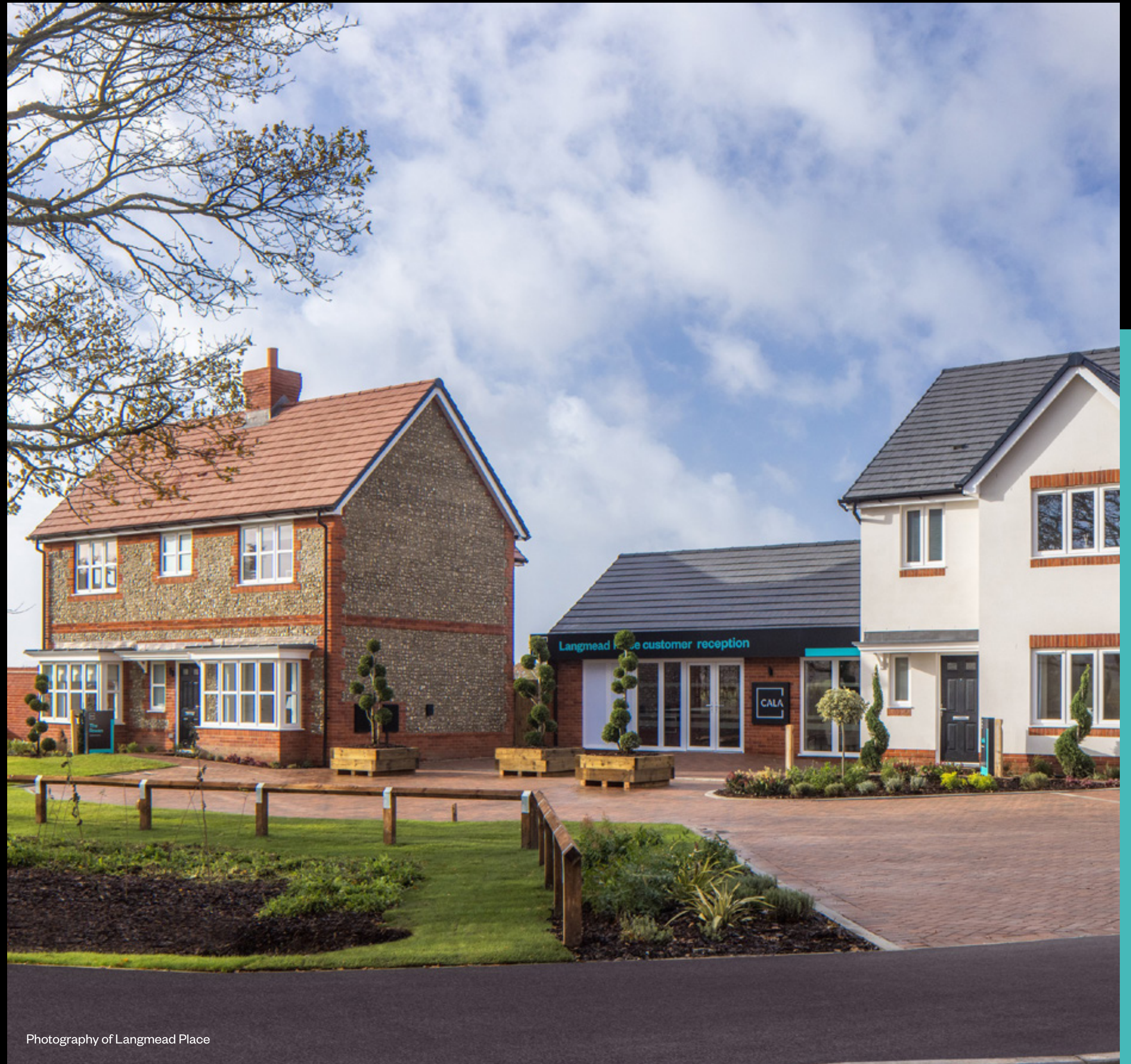
Photography of Langmead Place

With a wide range of superbly designed 2, 3 and 4 bedroom homes to choose from, flooded with natural light and with flexible spaces to suit your changing needs, Langmead Place is ideal for every lifestyle and life stage. High quality specifications and sustainable and energy-efficient features throughout are complemented by attractive exteriors and gardens, in a delightfully landscaped environment.