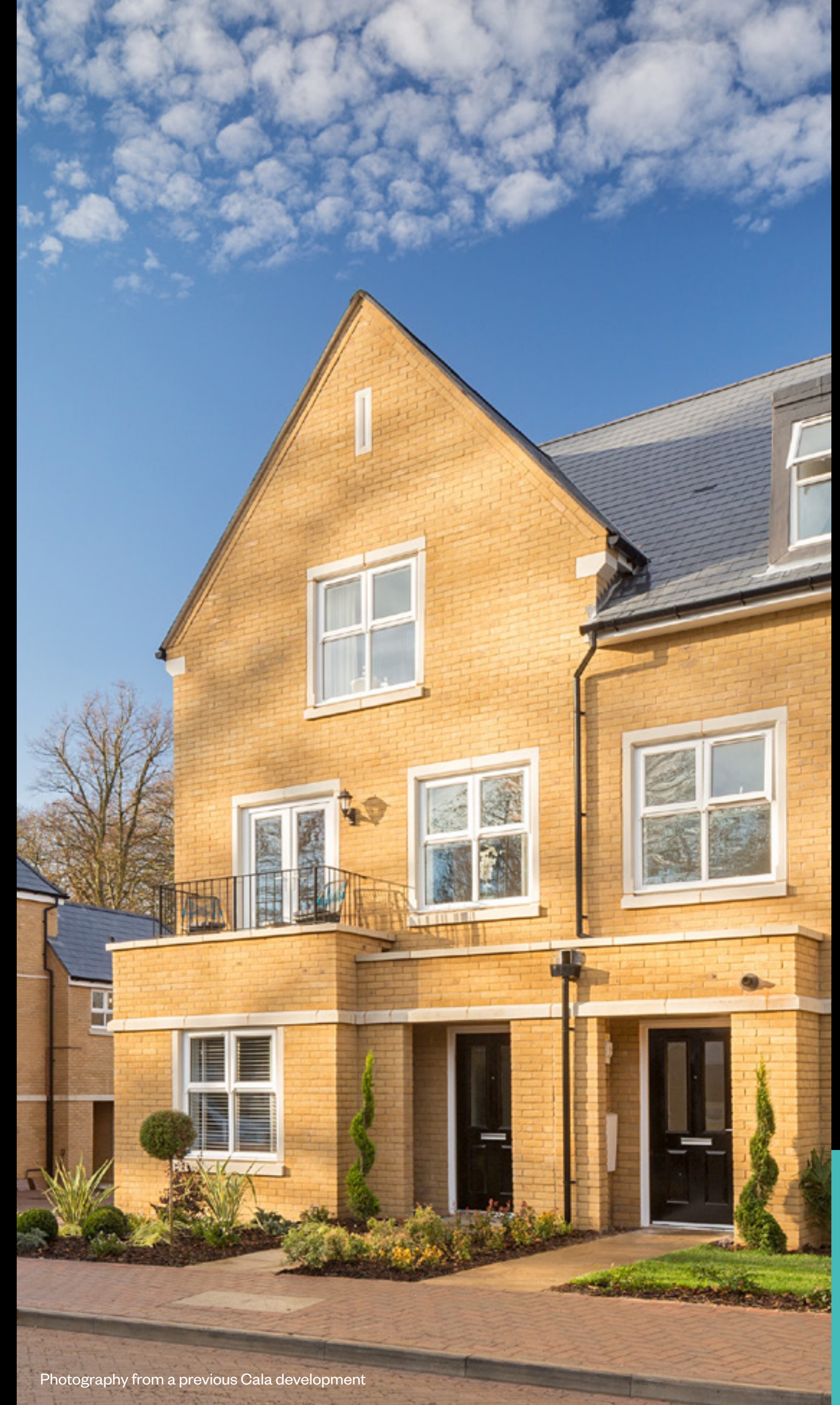
Photography from a previous Cala development