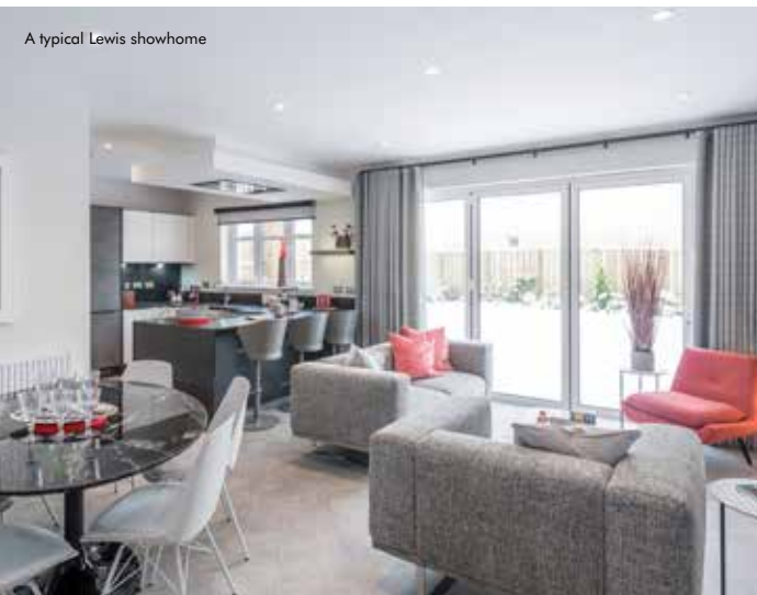
A typical Lewis showhome

So whether you're looking for more space for all the family, or to downsize without compromise, The Lewis could be the perfect choice for your whole new beginning.