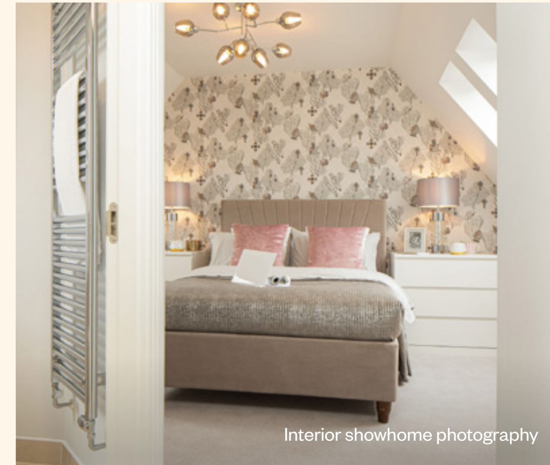
Interior showhome photography

As a bee-friendly town and after close collaboration with the community, Cala also adjusted their landscape and planting plans to make the site even more attractive to wildlife. This included the creation of an orchard, promoting bee-friendly measures and ensuring ample landscaping for wildlife to thrive.