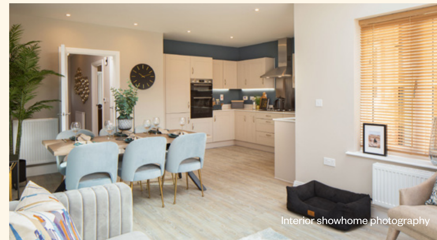
Interior showhome photography