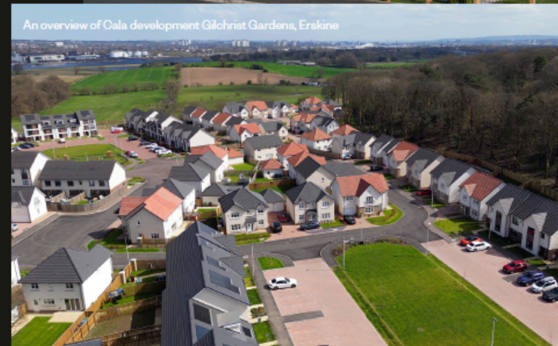
An overview of Cala development Gilchrist Gardens, Erskine