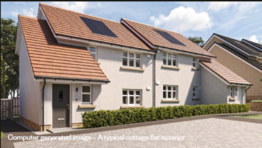
The Abby and Abbott 1 bedroom cottage flats