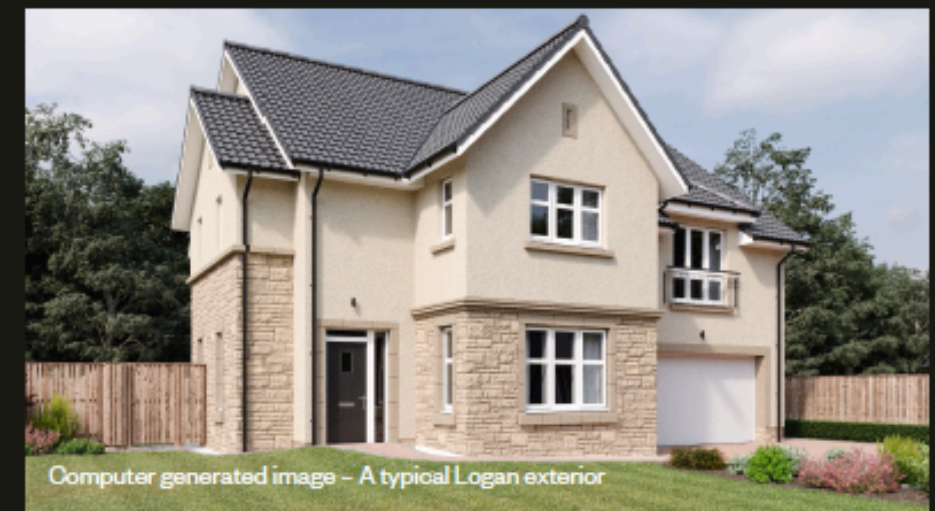
The Logan 5 bedroom detached home