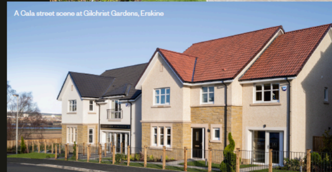
A Cala street scene at Gilchrist Gardens, Erskine