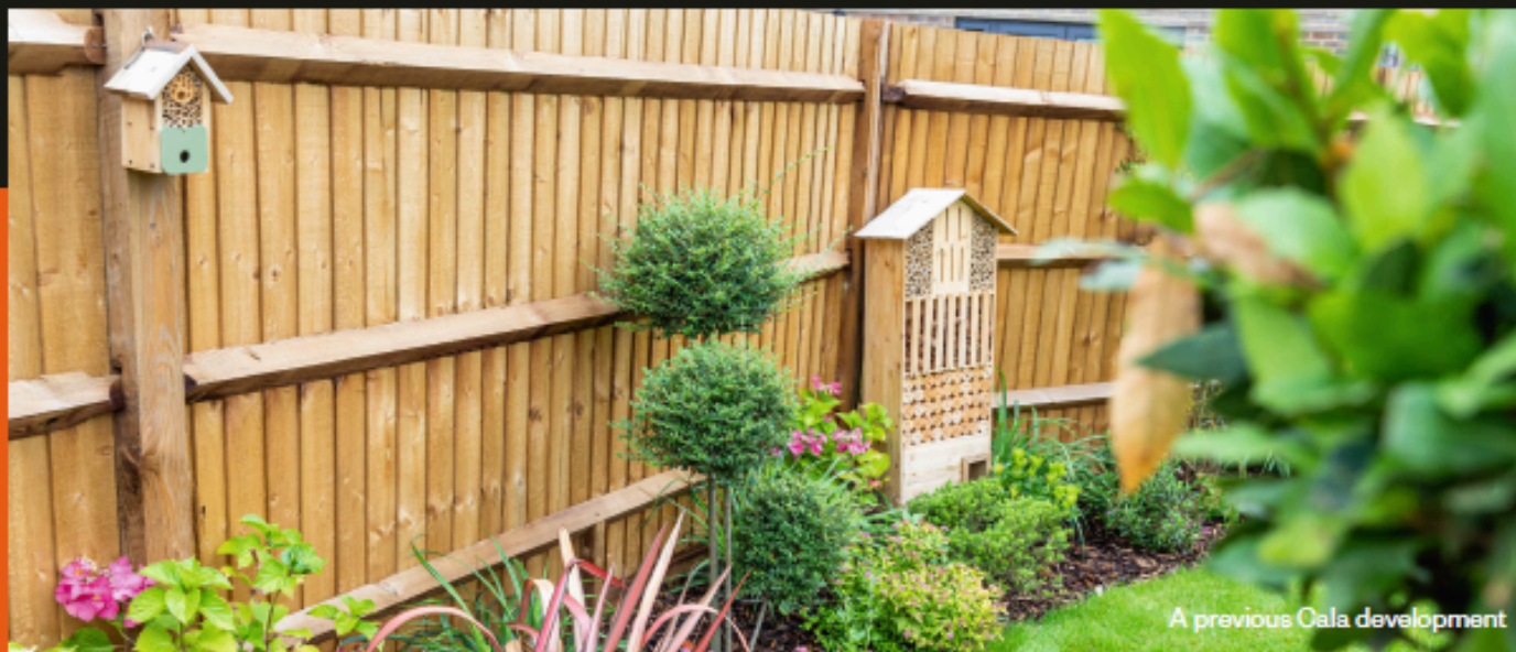
A previous Cala development