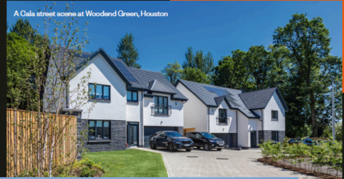
A Cala street scene at Woodend Green, Houston