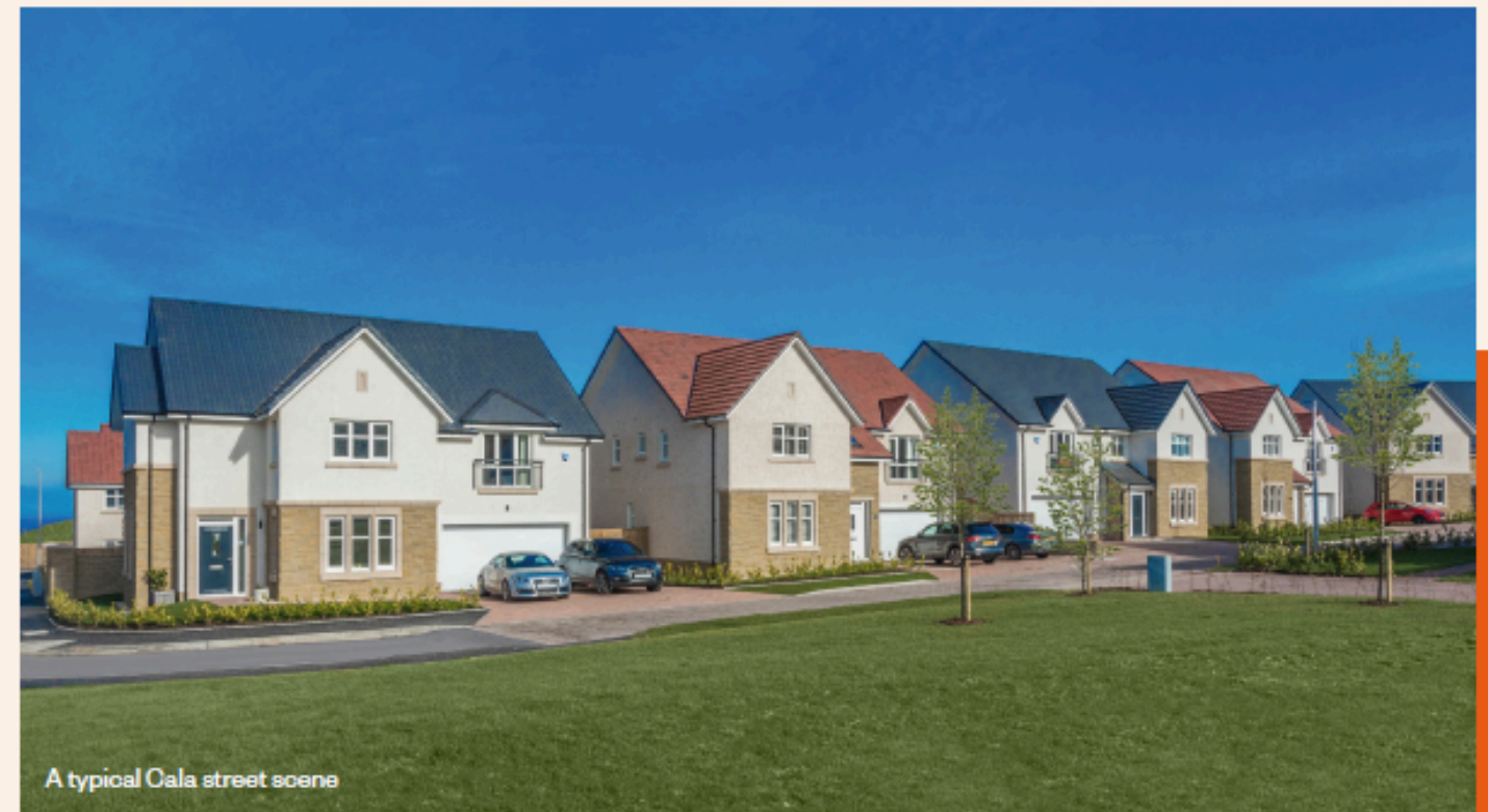
A typical Cala street scene