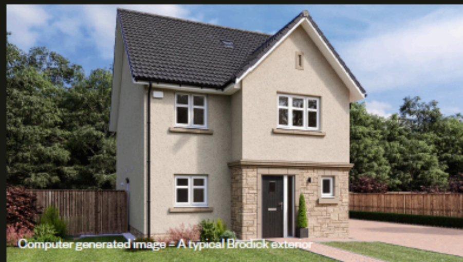
The Brodick 4 bedroom detached home