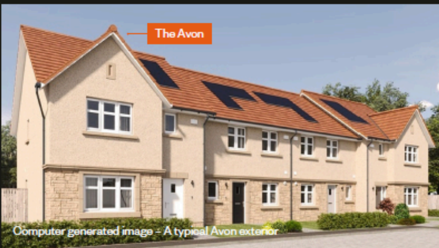
The Avon 3 bedroom terraced home