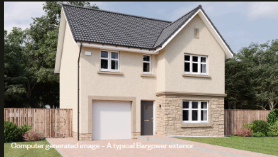
The Bargower 4 bedroom detached home