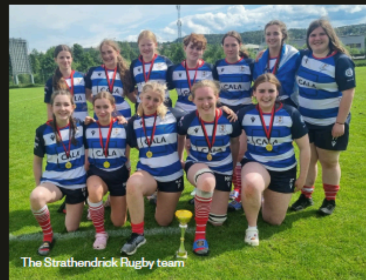
The Strathendrick Rugby team

In conjunction with our upcoming Ballagan Woods development in Killearn, Cala West made a donation to Strathendrick Rugby Club enabling them to design and purchase new kits for their women's senior team and girls under 12s teams.