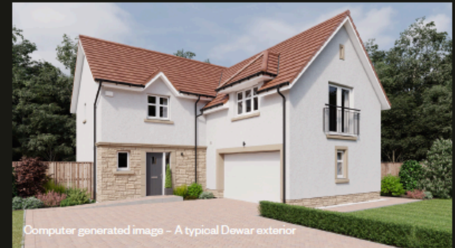
The Dewar 5 bedroom detached home